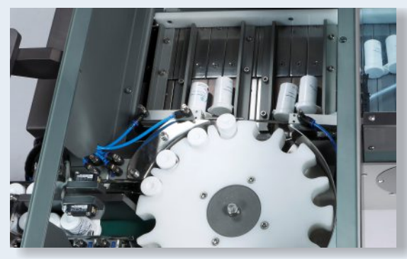
Bottle Loading Starwheel