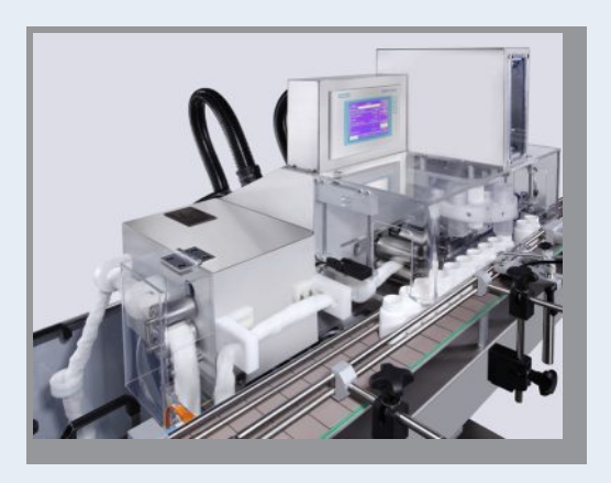
MOTORIZED FEEDER FOR COTTON COIL